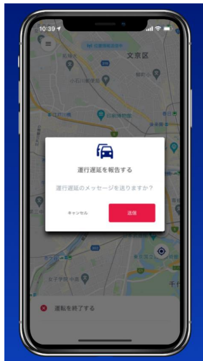
「AIG Drive for pick up car」

Through the app, the drivers of shuttle vehicles and the facility staff in charge of boarding can concentrate on safer operations and better client care, and will be able to more quickly and easily grasp the real-time status of the vehicles. The minimization of wait times will itself reduce the burden on facility users, who may have difficulty managing delays, and their family members who may be busy with other domestic or professional duties.