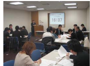
BCP Earthquake Simulation Training

Business Continuity Plan (BCP) formulation and operation are explained in a way that is easy to understand, including the basic principles of BCP that will allow for business continuity in the event of an earthquake or other disaster.