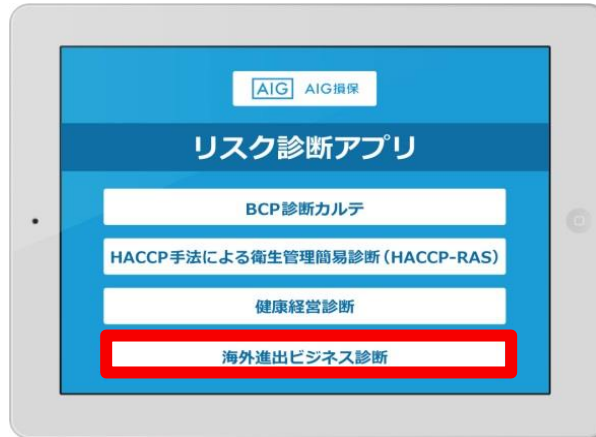
AIG General's risk diagnostic app