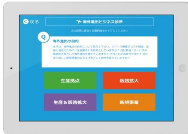
Questionnaire (about 20 questions)