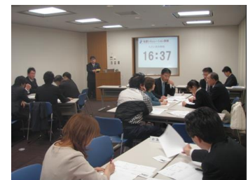
BCP Earthquake Simulation Training

AIG General advises customers on how to create a BCP or how to improve an existing BCP.