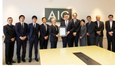
AIG executives with members of JQA and the BCM Team